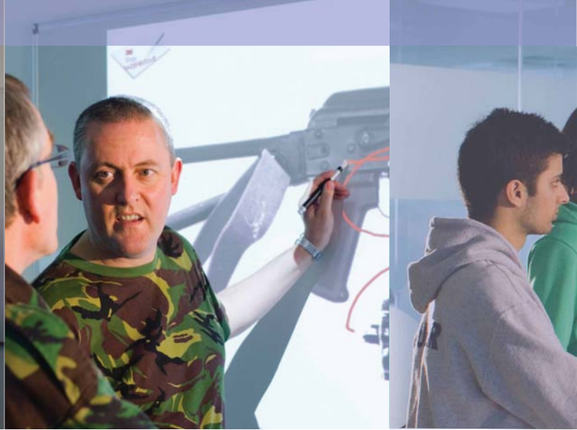
Ideal for military briefings and training