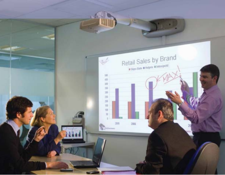
Simply Interactive – bringing total involvement to business meetings