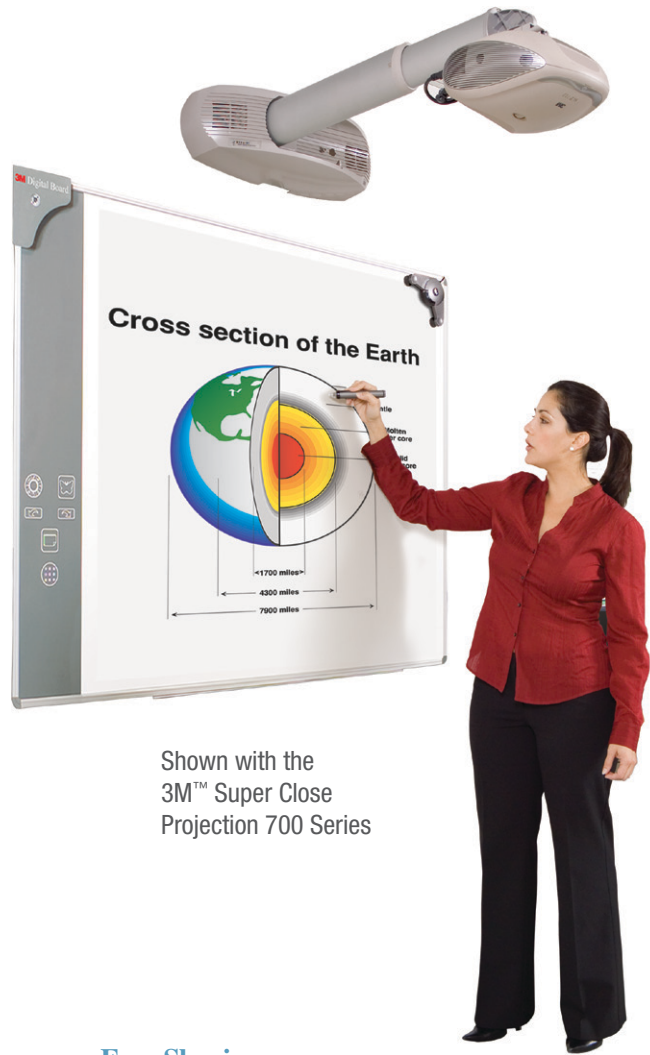
Shown with the 3M™ Super Close Projection 700 Series